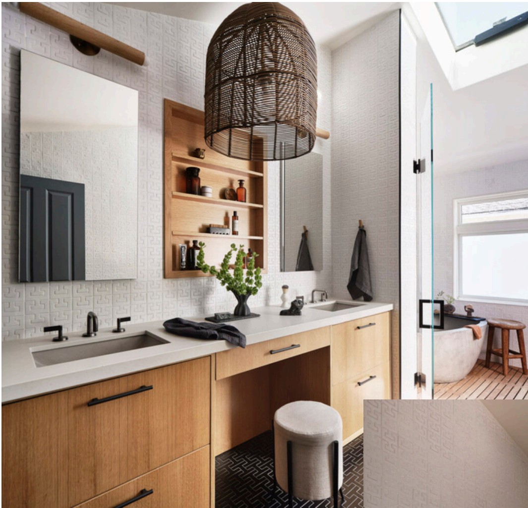
In the main bathroom, the floor and wall tiles are Homme and Femme by Fireclay.