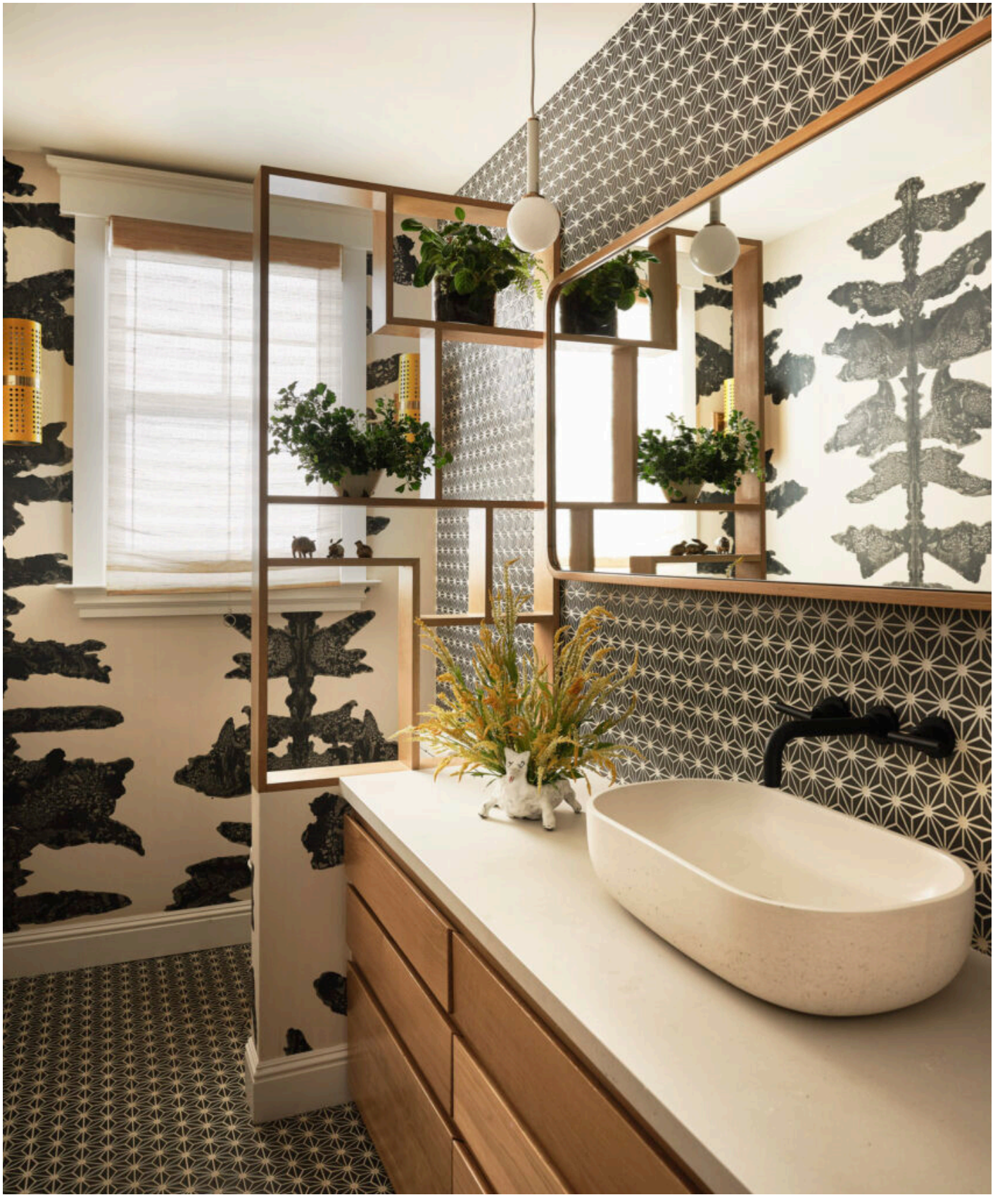
The powder room features wallpaper by Porter Teleo and yellow vintage sconces found on 1st Dibs.