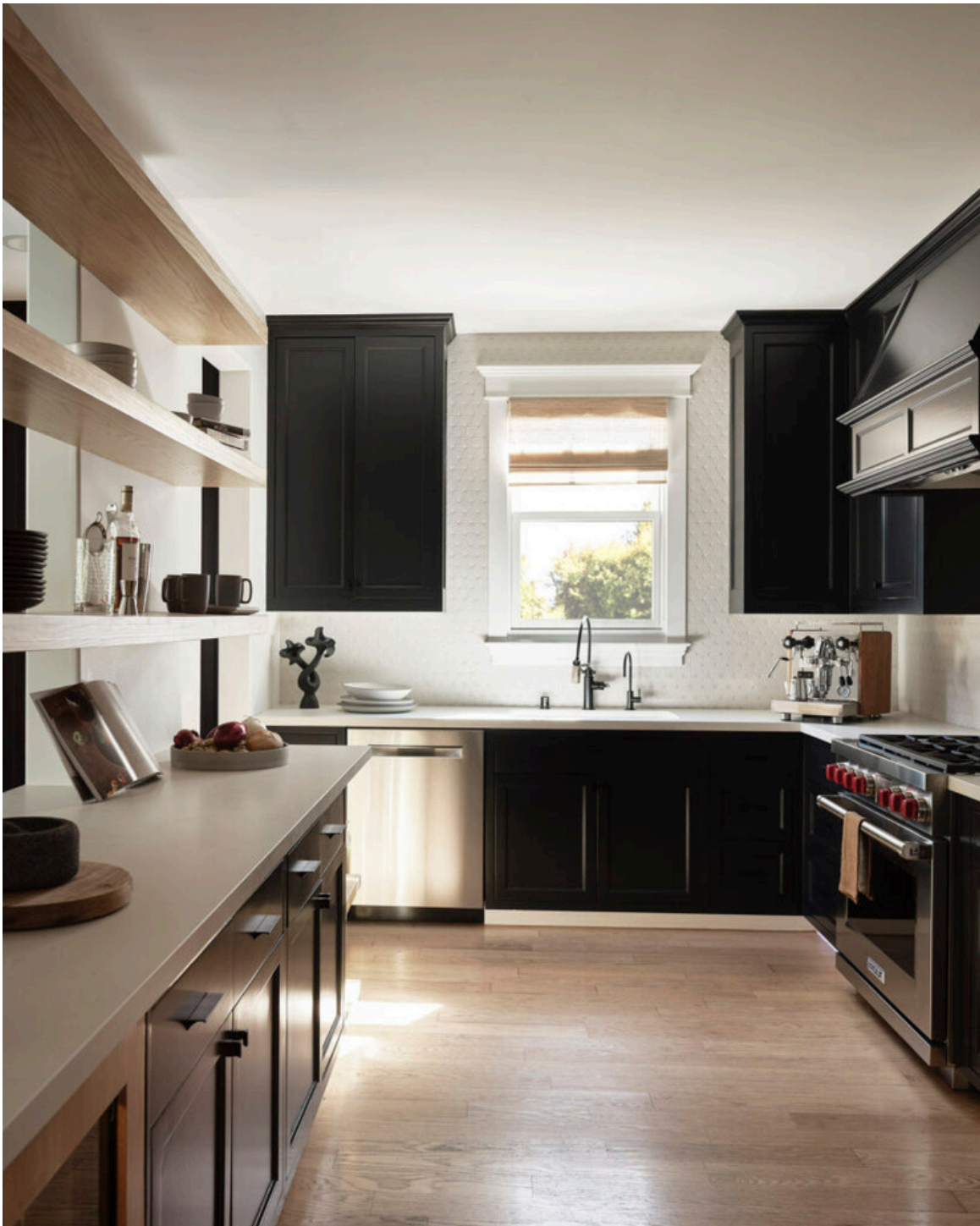
The kitchen features backsplash tile by Hoshi Tile, and countertops by CaesarStone.