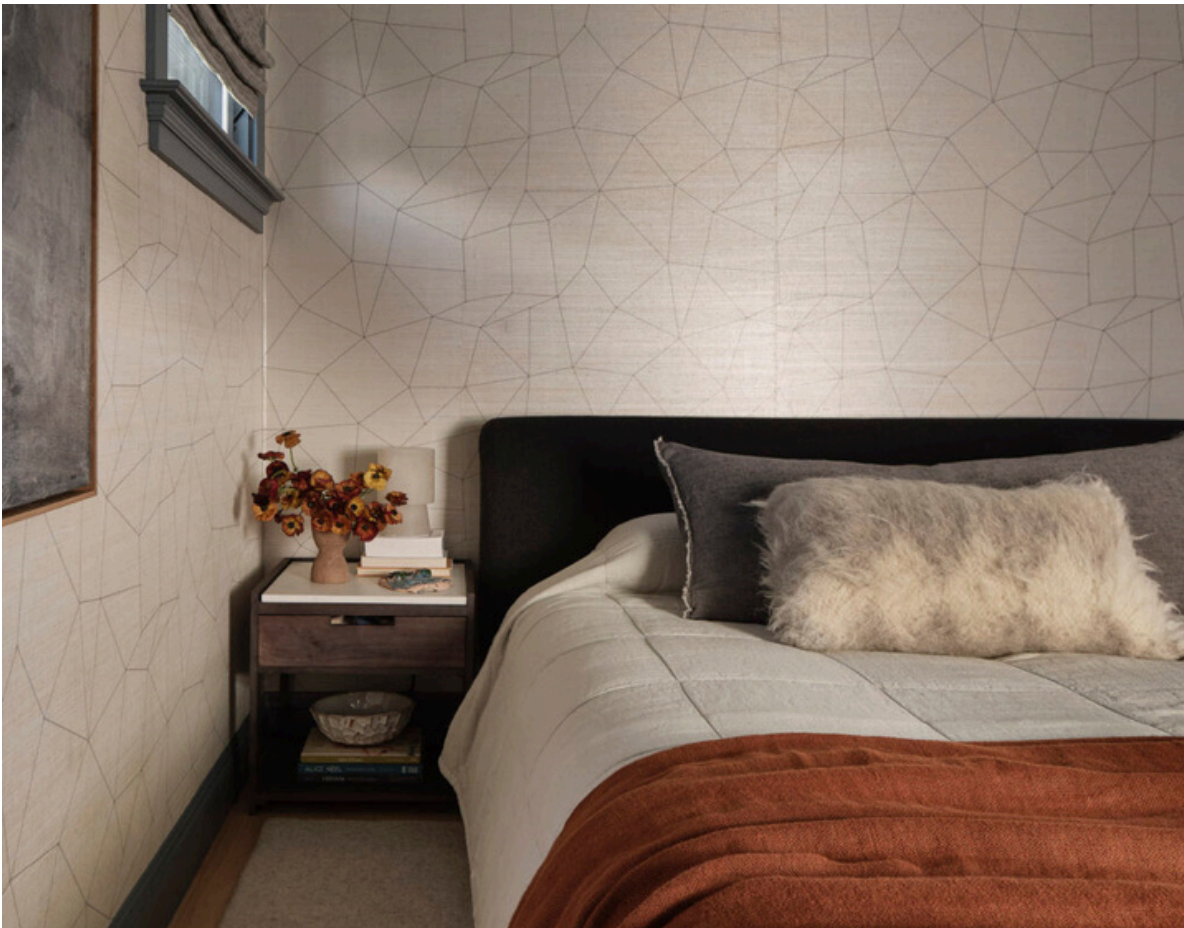
The main bedroom features wallpaper by Aux Aubris and Alabaster lamps by Summerhouse in Mill Valley. Photos by R. Brad Knipstein, styled by Matador Studios.