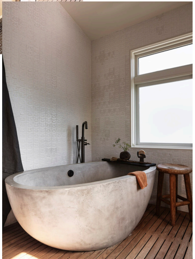
The concrete tub is by Native trails, the tub filler is by Watermark.